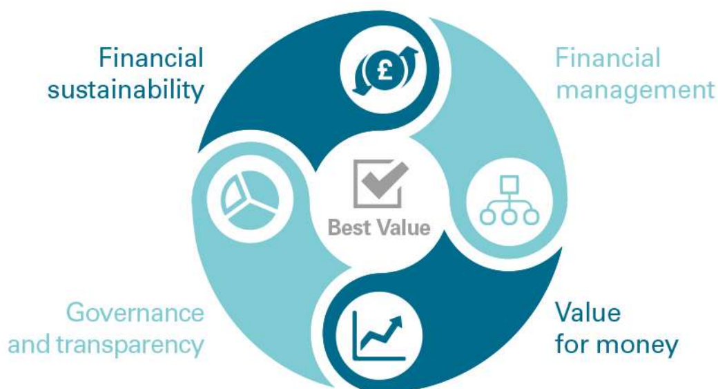
Exhibit 1 Audit dimensions